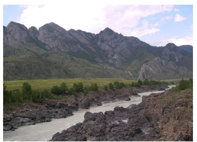
The Katun accretionary complex: paleoseamount pillow lavas and carbonate cap