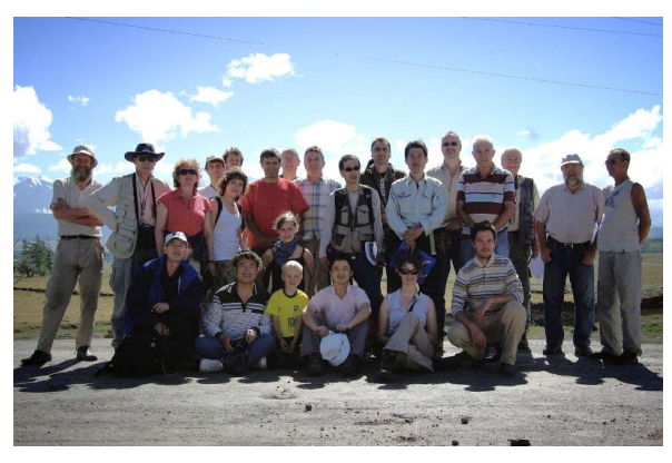
Friendly sunny morning in Altay