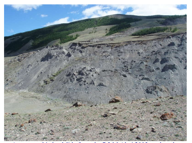
A catastrophic landslide from the 7.3 M Altai 2003 earthquake