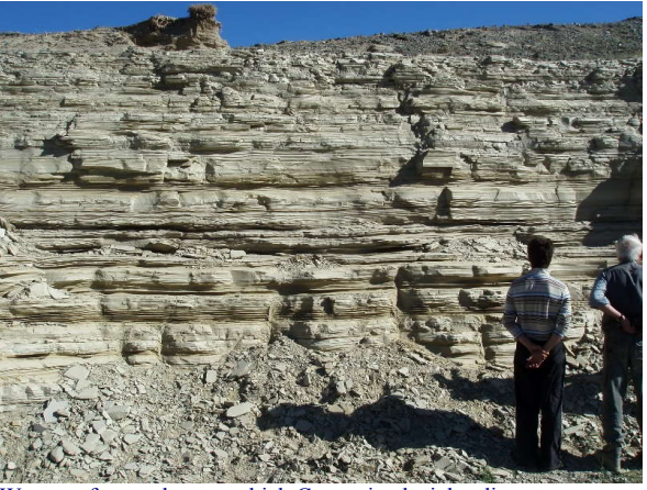
Warves of several metres thick Cenozoic glacial sediments